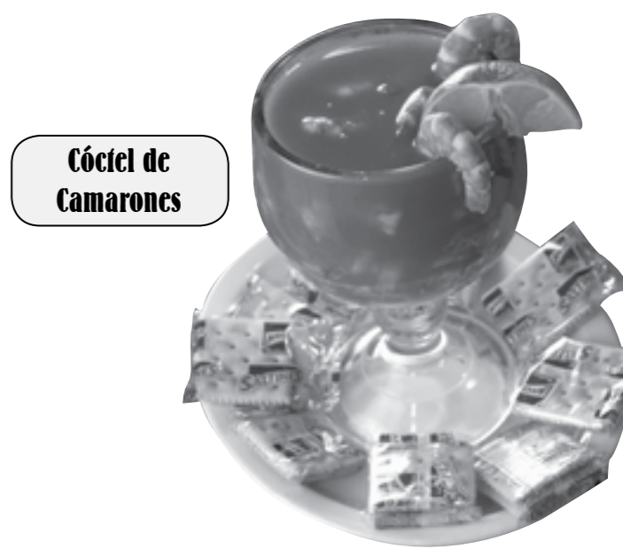
Cóctel de Camarones