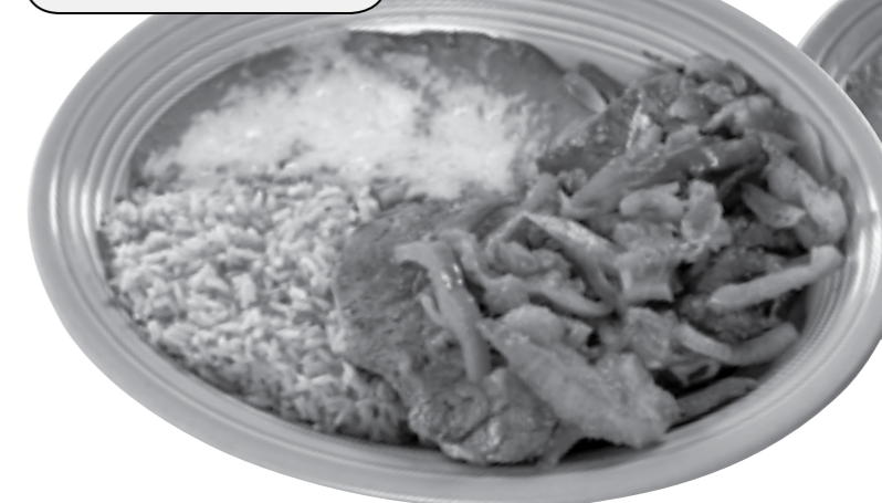
Steak a la Mexicana